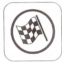
End of regularity test